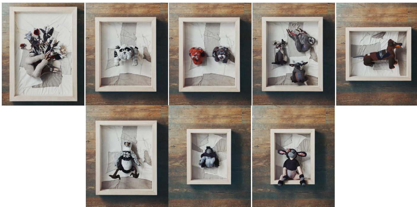
Hortense / Marguerite / Marguerite S / Hortense, Rosalie, Pavot / Eglantine / Dalia / Iris / Begonia