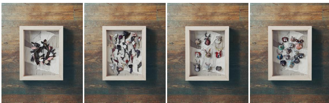
Floral wreath / Flower brooch / Trophy hunting miniature brooch

Anne-Valérie gives a name to each one of the placed textile sculptures. The animals created this time are named after old-fashioned French flowers.